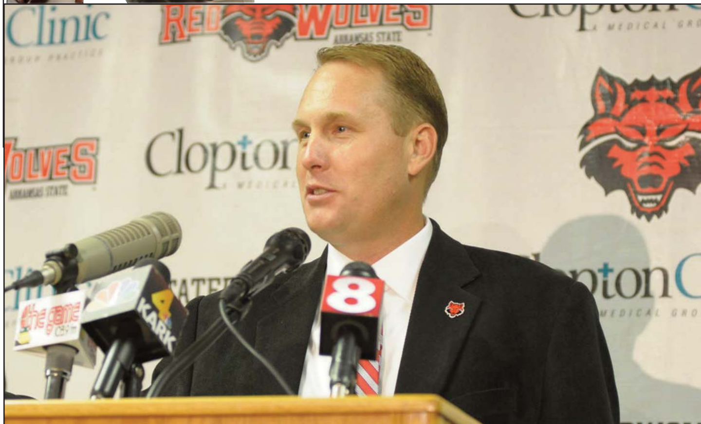
Hugh Freeze was named Arkansas State's 27th head coach Dec. 2, 2010.